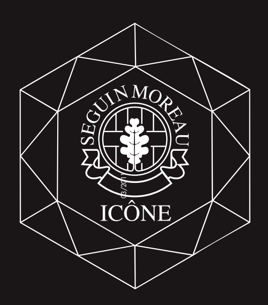
"Inspired by the past, built for the future"