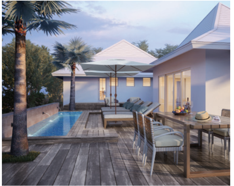
DSRT SURF RESORT – PALM DESERT, CA