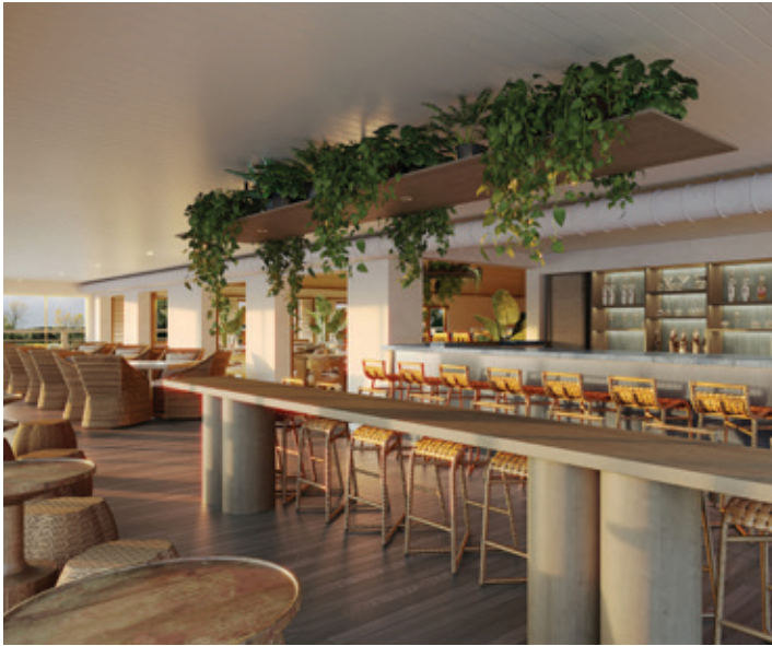
THE COVE – ELEUTHERA, BAHAMAS