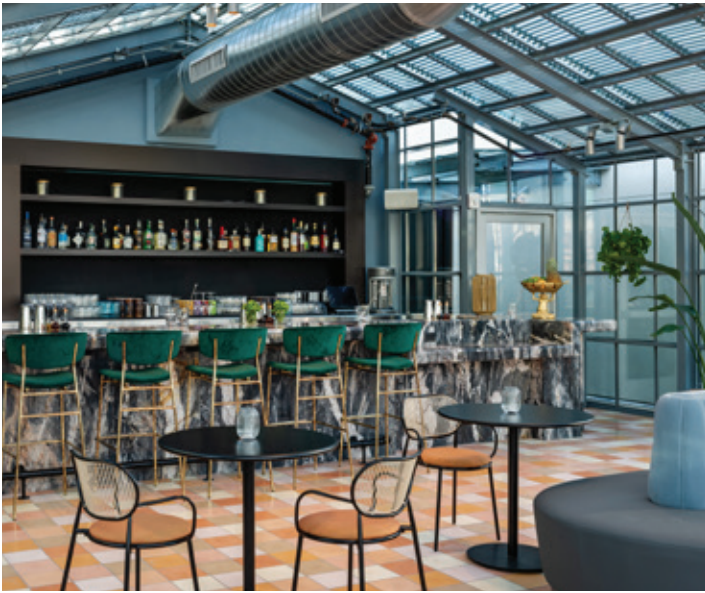
THE LINE HOTEL – SAN FRANCISCO, CA